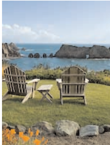
Arthur Preston • Coastal Scenic