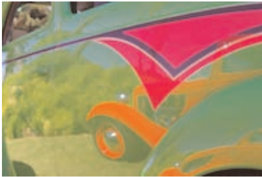
Patricia Marroquin • The Old in The New