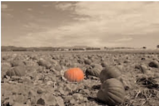
Arthur Preston • Pumpkin Patch