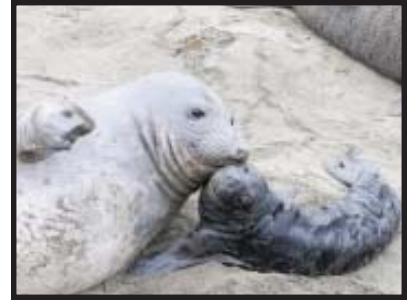
Harold Epstein -Seal Mom and Pup