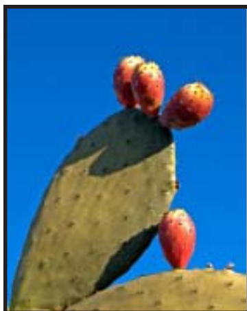
Fred Widney - Cactus Apples