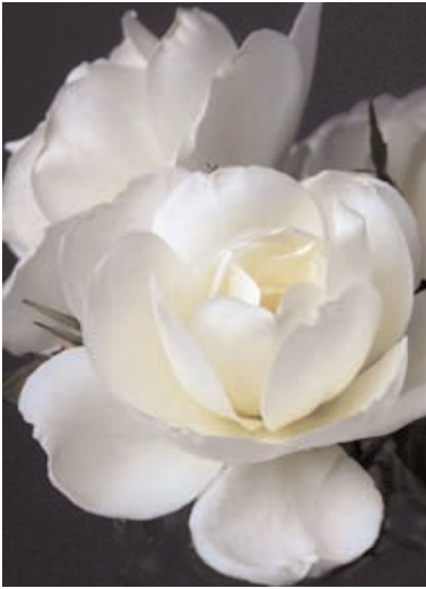
Pat Osborne • Natural Beauty