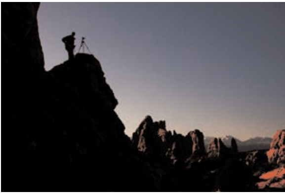
Roy Allen • In the Morning Sky