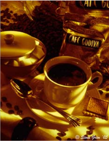
3rd. Sioux Grimm