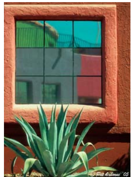
2nd Pat Osborne