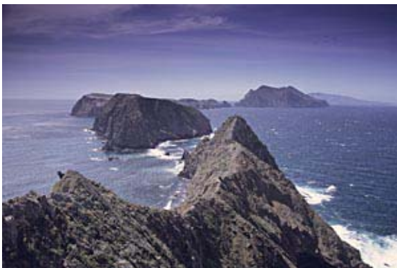
Roy Allen "Inspiration Point"