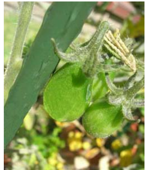
Roy Amick "Not Red-e"